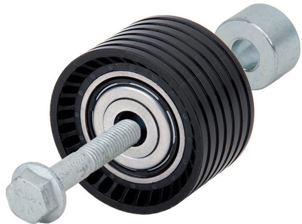
Fig. 2: 532 0654 10 – Deflection pulley with new seal design and add-on components

Part no.: 532 0774 10 (new) 532 0654 10 (new) 532 0221 10 (replaced)